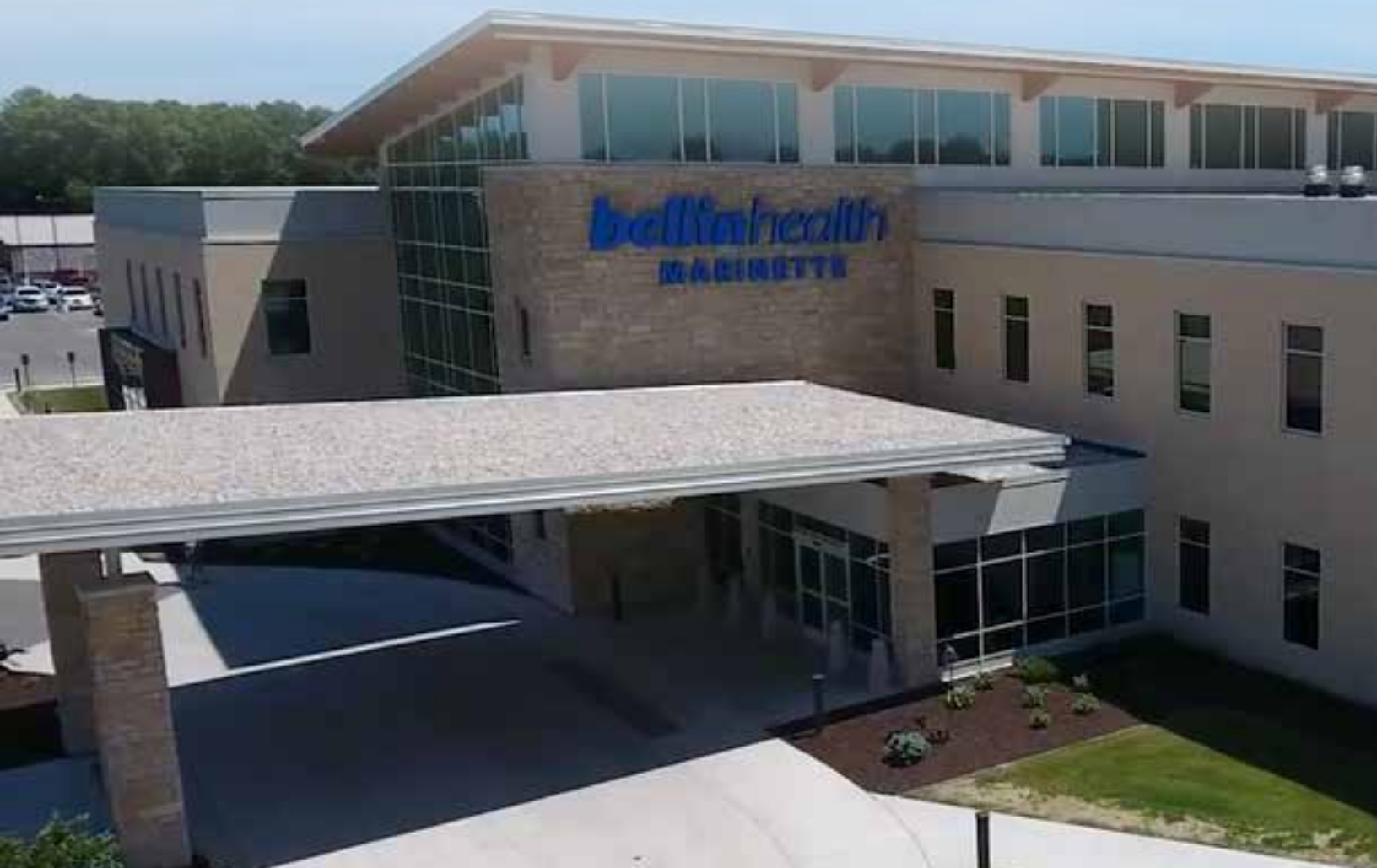
New Bellin Health Marinette Facility